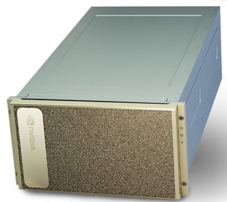
NVIDIA DGX A100