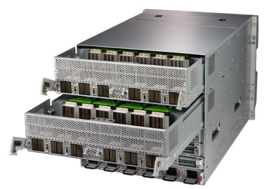
NVIDIA HGX-2 architecture WinFast HSA1600