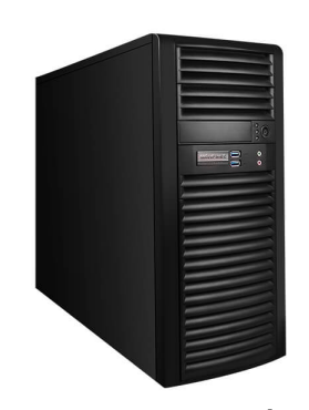
NVIDIA NGC-Ready WinFast RTX AI Workstation